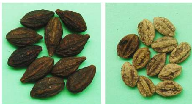
Fig-1: Seeds of Terminalia chebula Retz

elucidation of antimicrobial[14] and metabolic constituents[15]. T. chebula fruit and seeds exhibited dose dependent reduction in blood glucose of streptozotocin induced diabetic rats both in short term and long term study and also had renoprotective activity[16,17].