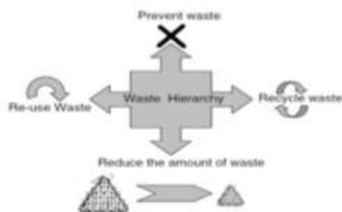
Fig-1: waste hierarchy

Due to fast growth in population, the amount and type of waste materials have increased accordingly. Many of the non-decaying waste materials will remain in the environment for hundreds, perhaps thousands of years. The non-decaying waste materials cause a waste disposal crisis, thereby contributing to the environmental problems. The environmental impact can be reduced by making more sustainable use of this waste. This is known as the waste hierarchy shown in Fig.1. The aim is to reduce, reuse, or recycle waste, the latter being the preferred option of waste disposal.