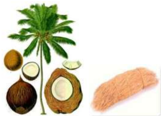
Fig-3: Coconut tree, coconut, coconut fiber