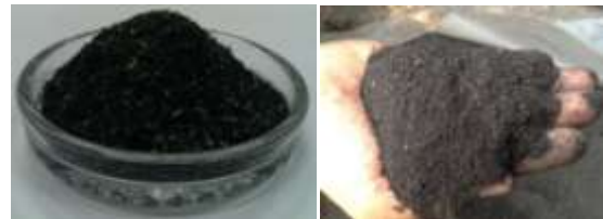
Fig-2 :Rice-husk ash

Lanka. Its total value is estimated at $100 million. India and Sri Lanka are also the main exporters, followed by Thailand, Vietnam, the Philippines and Indonesia. Around half of the coconut fibres produced is exported in the form of raw fibre [4]. Fig.4 shows the longitudinal cross section of coconut fibres.