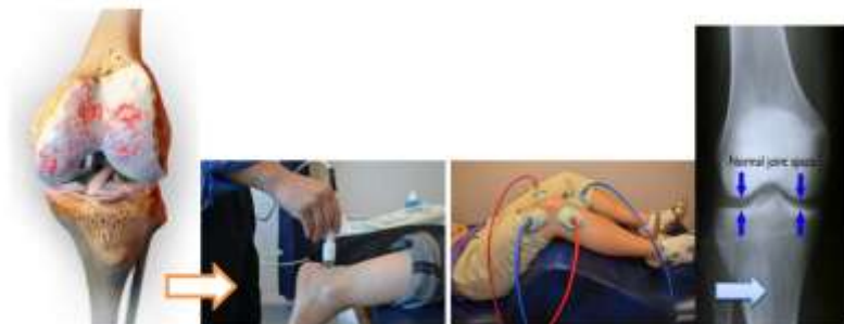
Fig-1a, 1b and 1c: shows patient knee during Osteoarthritis and after treatment of Shortwave diathermy effect on OA[2]

Shortwavediathermy (SWD) is one of several physical therapy modalities and used predominantly as a pain reduction modality in the clinical practice. Ideal treatment time is 20-30 minutes .Some Institute in our country practice 10 minutes SWD in treatment of OA Knee, because of time accommodation and limited resources for huge rush of patients. So in this condition a question arise that, whether 10 minutes SWD in treatment of OA knee is as effective as 20 minutes SWD. With all possible searches no such study was found for evaluation of comparative effects of 10 minutes and 20 minutes SWD in treatment of osteoarthritis knee. This comparative study was done to see the effects of 10 minutes SWD and 20 minutes SWD on OA knee.