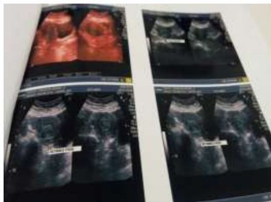
A. Before Evacuation