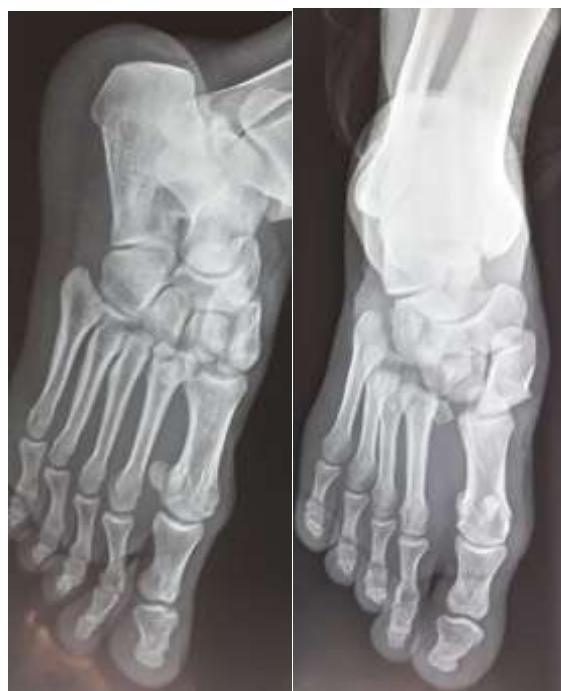
Fig-1: (a, b): A standard X-ray of Face and 3/4 of the right foot showing a fracture dislocation type A of Lisfranc according to Mayerson classification

According to the classification of MEYERSON [5, 6]: 8 cases, ie 40% of Type A (total dislocation) (Figure-1). 6 cases, ie 30% of Type B (partial dislocation), including 2 cases of type B1 (columnaire) and 4 cases of type B2 (spatular). 6 cases, ie 30% of Type C (divergent dislocation).