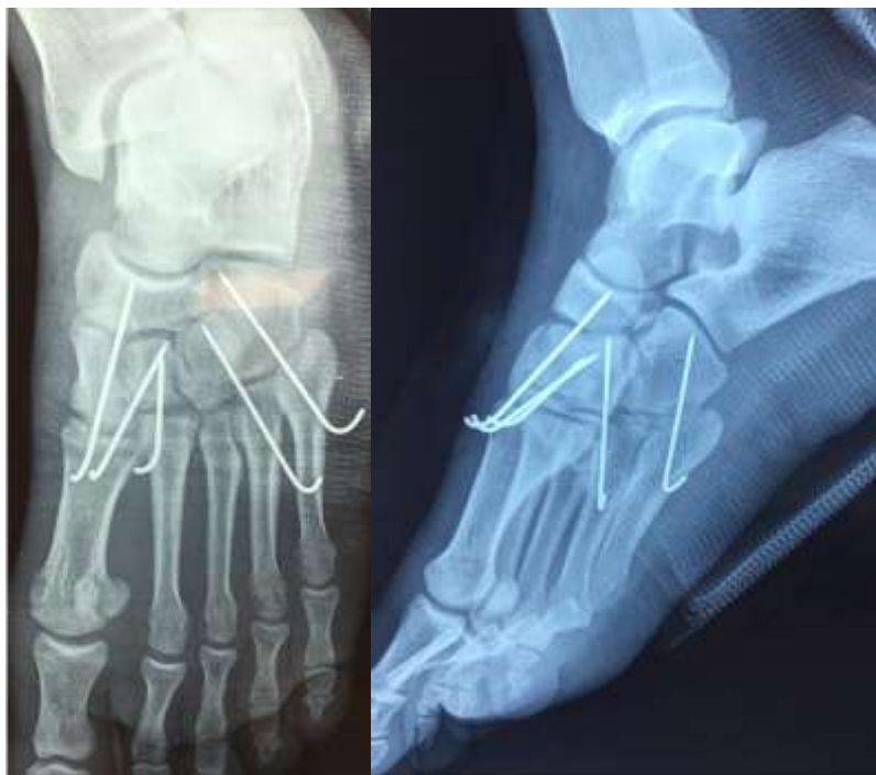
Fig-2: (a, b): Postoperative X-rays of Face and profil of the right foot showing anatomical reduction.

most of our patients have preferred to continue at home or neglect.