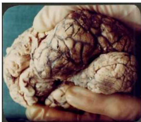
Fig-2: Cerebral Hemispheres showing multiple tubercles (arrows) in case of TBM

typical in majority of the cases showing rise in proteins and cells, predominantly lymphocytes. In most of these cases the diagnosis was suspected clinically. Pulmonary tuberculosis was found in 21 cases. Out of these 50 cases of tuberculous meningitis, 32 were males while 18 were females. In this study, six cases of tuberculoma [5] were encountered. Out of these six cases, three were associated with tuberculous meningitis. Male to female ratio was 2:1. The four tuberculomas were situated in the cerebellum (infratentorial) and two were located in the cerebrum (supratentorial). In most of the cases, they were multiple in number (more than 3). The size ranged from 4 mm to 2 cm. They were grayish white in colour.