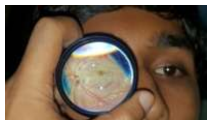
Fig-8: Optic nerve avulsion with crao