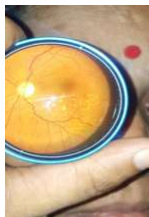
Fig-6: Old superio-temporal brvo with csme