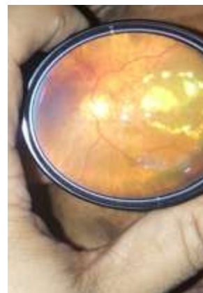
Fig-5: Circinate retinopathy

The described technique of smartphone fundus photography with the use of iPhone 6 or Samsung phones & 20D lenses was able to capture excellent, high-quality fundus images. Excellent results were achieved with the 20D lens. We found that even first-year ophthalmology residents (who were not comfortable with indirect) and ophthalmic assistants were also able to master this technique in relatively short period.