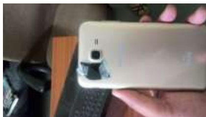
Fig-1: Flash light covered with glass piece from sunglasses