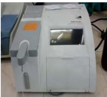
Fig-3: Semi auto analyser: Agapee Mispa Excel Chemistry