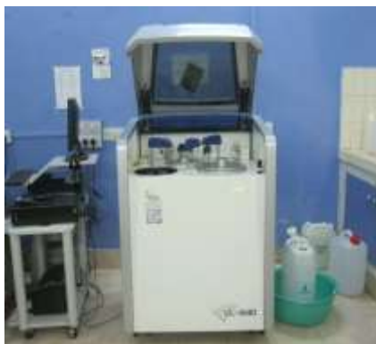
Fig 2: Auto analyser: Trasasia Erba Mannheim XL-640