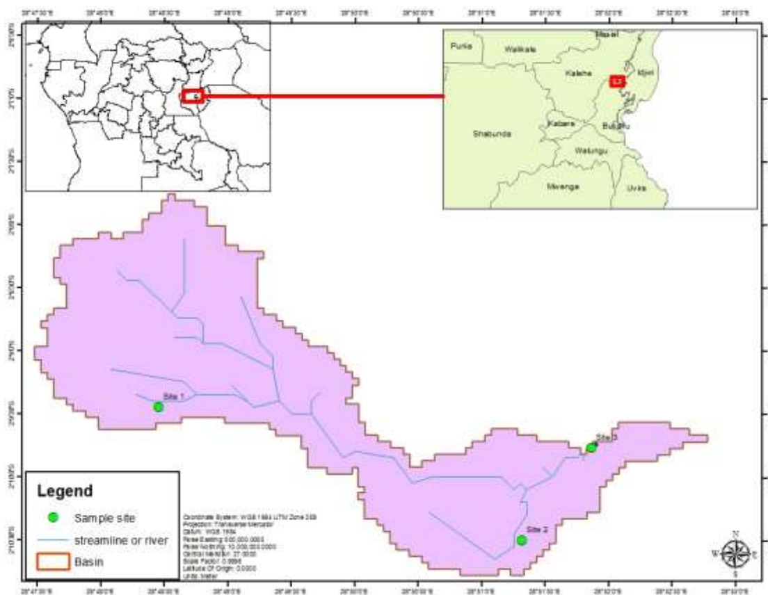
Fig 1: River Nyabarongo watershed and sampling points

Nyabarongo River is one of the tributaries of the Lake Kivu [15, 16]. It is located between two territories, Kabare and Kalehe in Eastern part of Democratic Republic of Congo. The river takes source in Kahuzi Biega National Park (PNKB) at 2000 m of altitude and passes through cultivated and deforested area of Lwamisakule, Changulube, Lugohwa, Ntagalywa, Karunvangoma, Cabwine-Mwami, Ceshero and flows in Lake Kivu in the bay of Kasheke-Irambo at 1465 m of altitude (Figure 1).