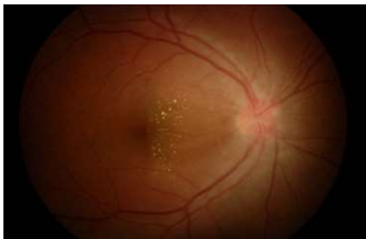
Fig 2: Left eye fundus showed left optic disc was hyperaemic without optic disc swelling