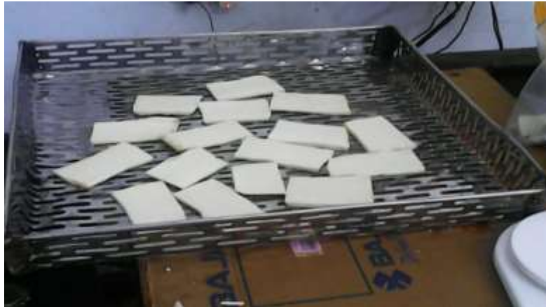
Fig-2: Tray loaded with yam sample