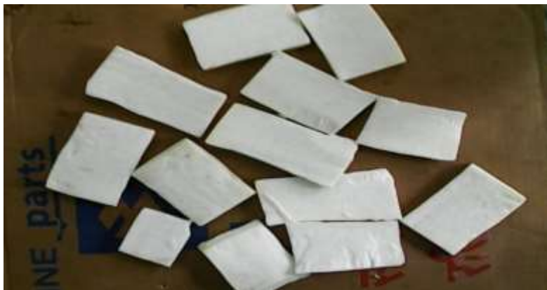
Fig-1: Yam sample before the experiment

The same procedure was repeated for drying temperature of 50^{\circ}\text{C} and 40^{\circ}\text{C} on different days.