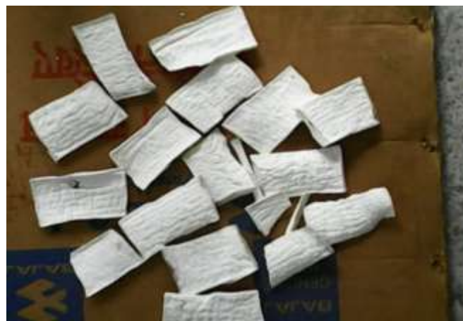
Fig-4: Yam sample after the experiment