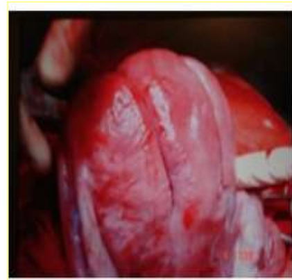
Fig-2: Posterior view of uterus showing Hayman suture Technique