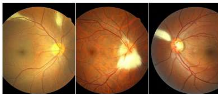
Fig. 1: Various locations of myelinated retinal nerve fibers in this study

The overall prevalence of myelinated retinal nerve fibers was found to be 0.47% (37/7,856). Out of 37 patients with myelinated retinal nerve fibers, 23 were men (23/4,421; 0.52%), and 14 were women (14/3,435; 0.40%). Myelinated retinal nerve fibers varied in location: they were around the vascular arcade, peripapillary region, and nasal region (Figure 1 left, middle, and right, respectively).