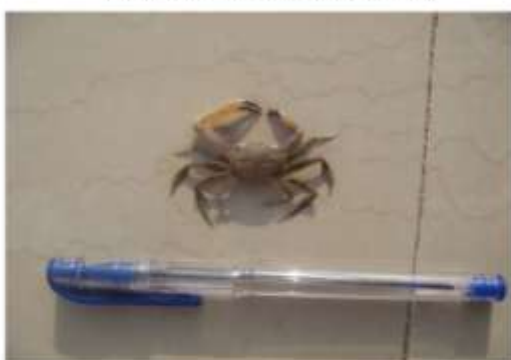
Goneplex rhomboides (Linnaeus, 1758)