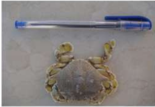
Ashtoret lunaris (Forskål, 1775)