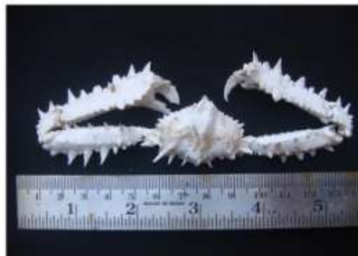
Parthenope echinatus (Herbst, 1790)