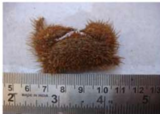
Pilumnus vespertilio (Fabricius, 1793)