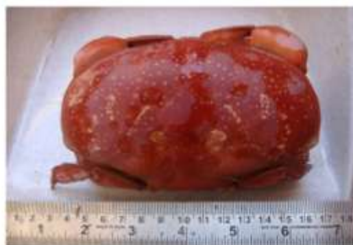
Atergatis integerrimus (Lamarck, 1801)