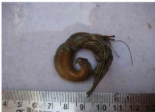
Clibanarius zebra (Dana, 1852)