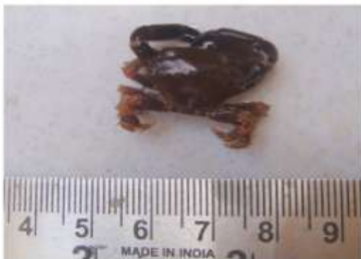
Chlorodiella nigra (Forsk., 1775)