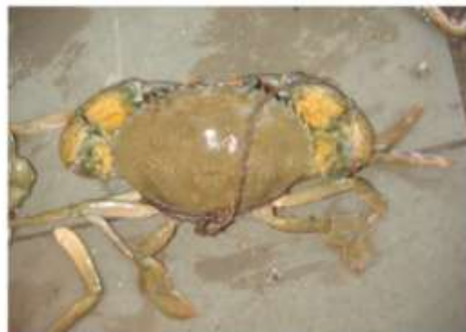
Scylla serrata (Forskål, 1775)