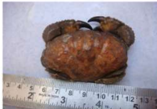
Platypodia cristata (A. Milne Edwards, 1865)