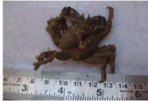
Schizophrys aspera (H. Milne Edwards, 1834)