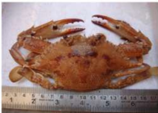
Portunus pelagicus (Linnaeus, 1766)