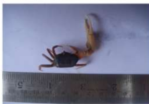
Uca lactea annulipes H. Milne Edward, 1837