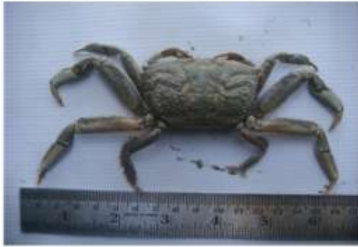
Macrophthalmus pectinipes (Guerin, 1839)