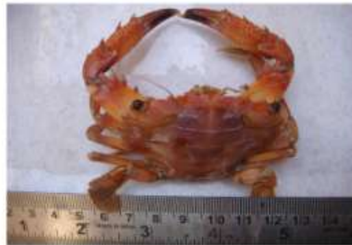
Thalamita prymna (Herbst, 1803)