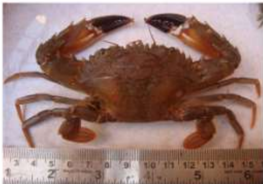
Charybdis orientalis Dana, 1852