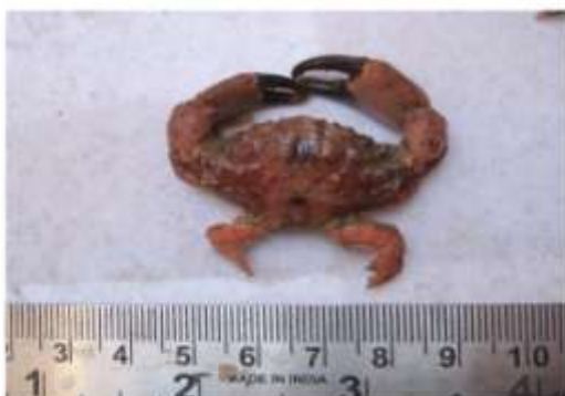
Leptodius sanguineus (H. Milne Edwards, 1834)