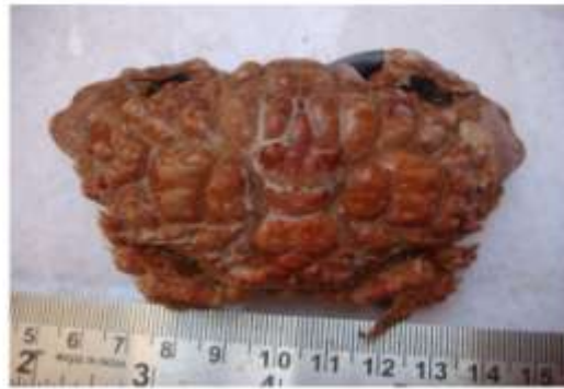
Euxanthus exculptus (Herbst, 1790)