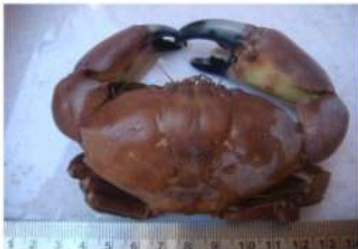
Menippe rumphii (Fabricius, 1798)