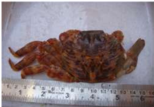
Grapsus albolineatus (Lamarck, 1818)