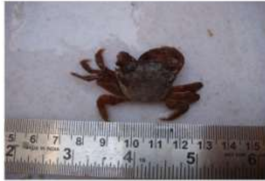
Metopograpsus messor (Forskål, 1775)