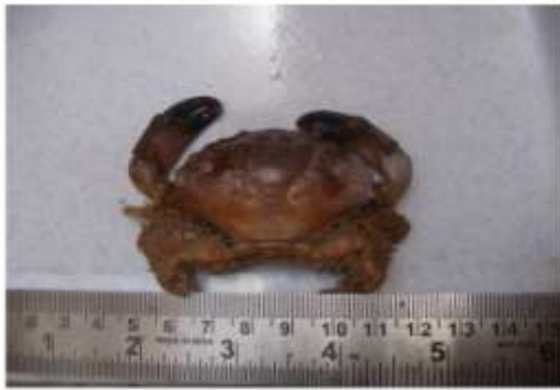
Etisus laevimanus (Randall, 1840)