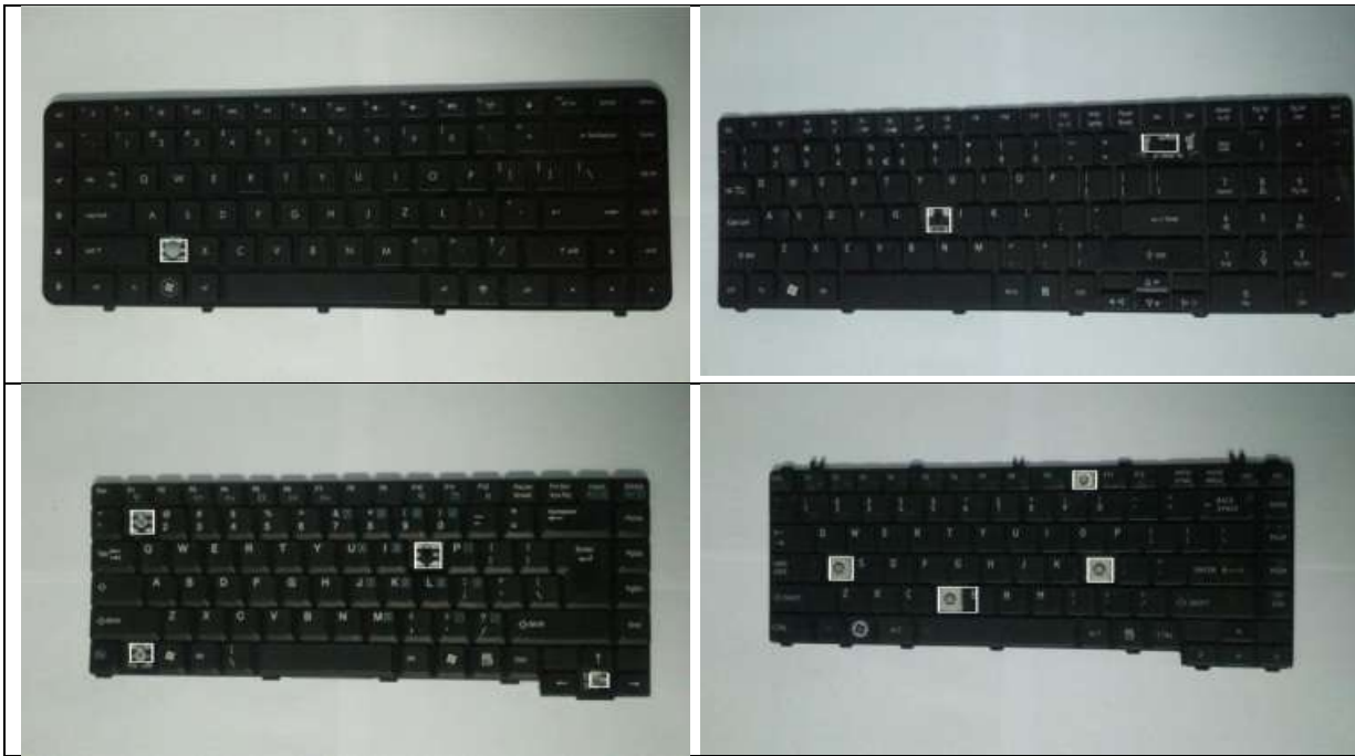
Fig-3: Detection of defective keys in different types of keyboards