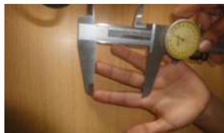
Fig. 3: Vernier Callipers for measuring figure length

It was measured straight distance from the midpoint of the proximal finger crease to the tip of the finger. Vernier calliper was used to measure the finger length, hand placed on the plane surface, palm of the hand is facing upwards.