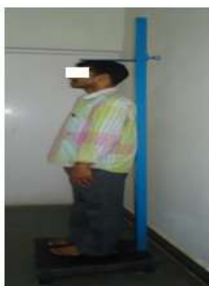
Fig. 2: Measurement of Stature Using Stadiometer

It was measured as vertical distance from the vertex to the foot. Measurement was taken by making the subject to stand erect on a horizontal resting plane, on the stadiometer bare footed. Palms of hand turned inwards and fingers horizontally pointing downwards and head oriented in eye-ear-eye plane (Frankfurt Plane). The movable rod of the stadiometer was brought in contact with vertex in the mid sagittal plane.